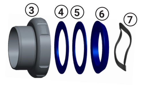
RIGHT/DRIVE 30mm I.D.