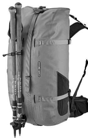
Application example: Attachment Kit for Gear (mounting trekking poles)