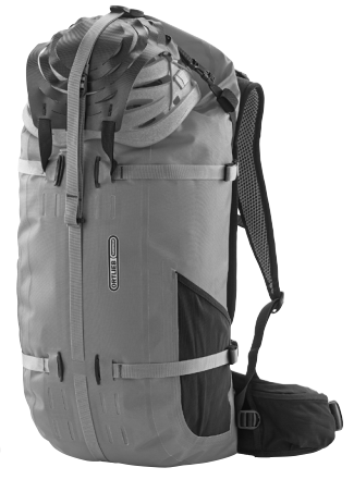
Application example: Attachment Kit for Helmets (universal mounting for various helmets and gear)