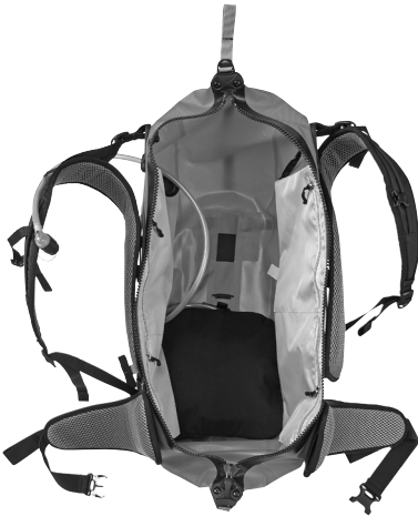
Application example: Hydration System