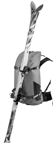
Application example: Attachment Kit for Gear (diagonal ski carrying)