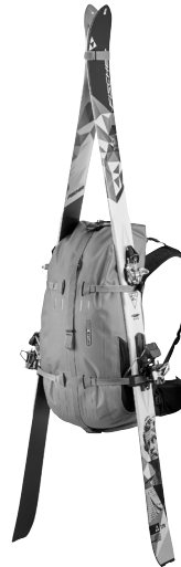
Application example: Attachment Kit for Gear (A-frame ski carrying)