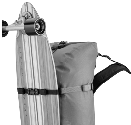
Application example: Attachment Kit for Gear