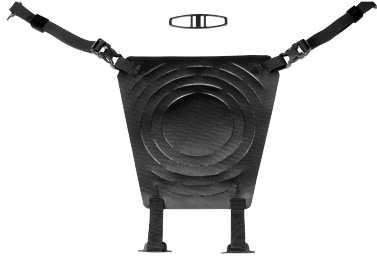
Attachment Kit for Helmets