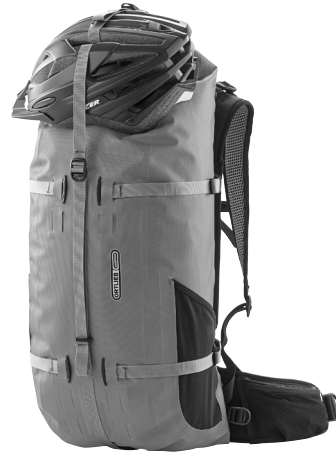
Application example: Attachment Kit for Helmets (helmet toggle for fixing helmets with larger ventilation slots)