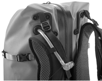
Waterproof hydration tube port