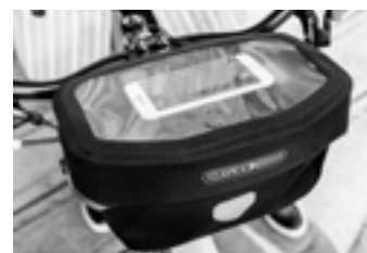
Smartphone in transparent lid compartment (not included)