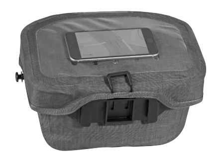
5 L version: smartphone in transparent lid compartment (not included)