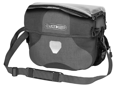
Mounting of optional accessory Ultimate Six Map-Case (not included)