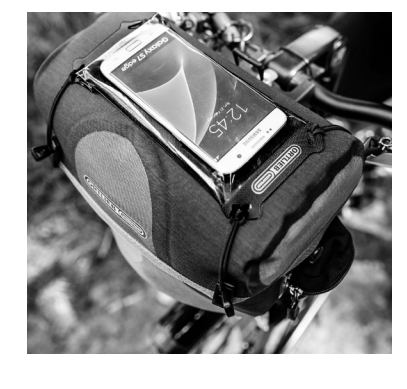
Mounting of optional Safe-It (not included)