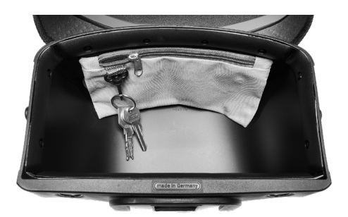
Carabiner with key chain