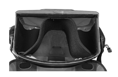
Ultimate Six Internal Divider (incl.)